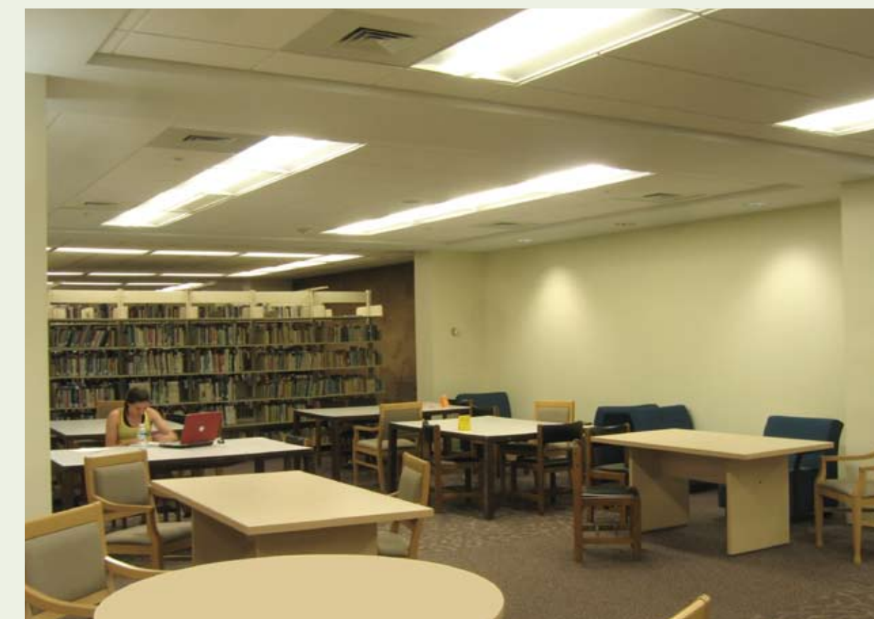
Existing Space James Branch Cabell Library, 4th floor

Meetings were held with the heads of Cataloging, Preservation, and Circulation Departments to determine potential problems and to develop a proposed workflow.