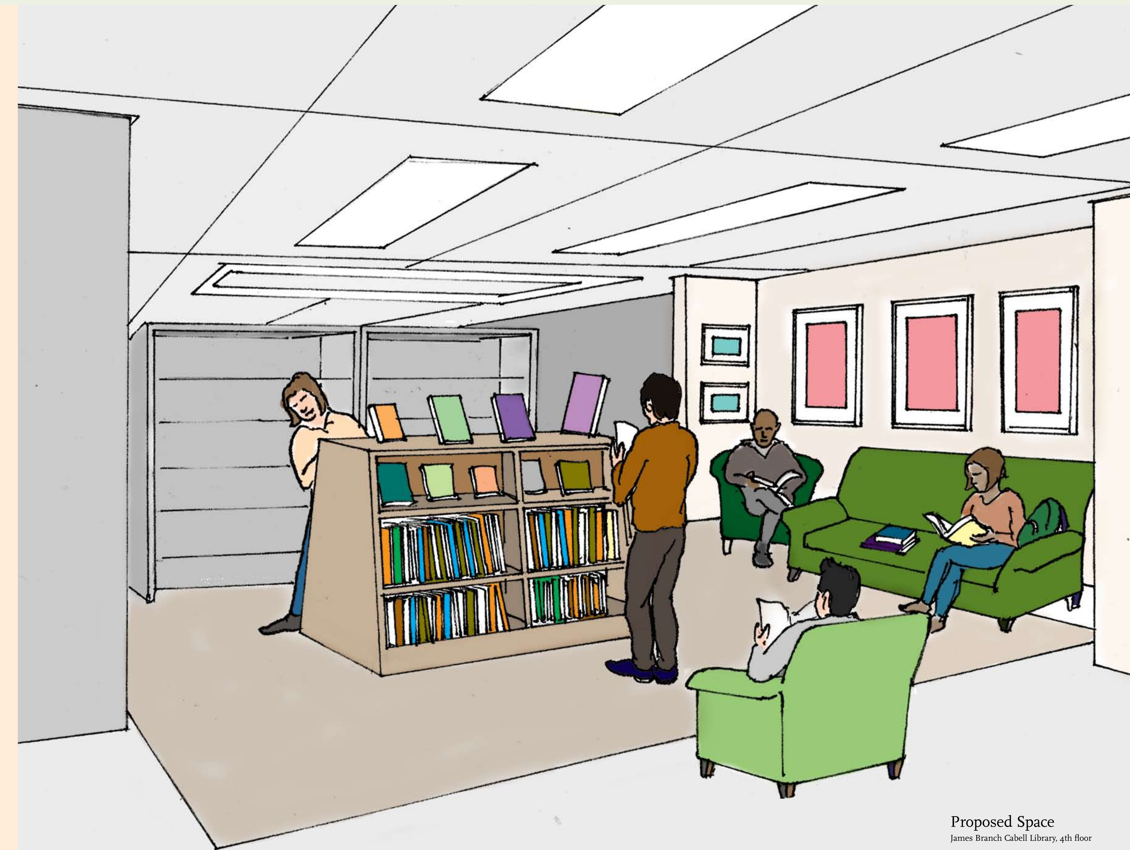
Proposed Space James Branch Cabell Library, 4th floor

The meetings addressed potential problems with the new browsing area. These include: user confusion when searching for books in a new location, staff time and division of responsibilities, and space issues in an already crowded library. A workflow plan was designed to minimize user access problems and to coordinate processing between departments.